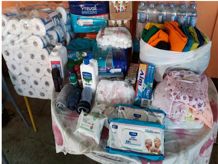
In February, members visited the Elayne Scantlebury Centre and presented the residents with a food hamper. Members interacted with the residents, shared fellowship in song and offered light refreshments.

In April a 'Hamper Project' was launched with support from the WestGAM - the past students' association of the Grantley Adams Memorial School, and the Lions Club Scotland District which both made generous contributions of money and food items to this initiative. In addition to the hampers, individual donations of cash, food items and games were donated by members to various persons in need.