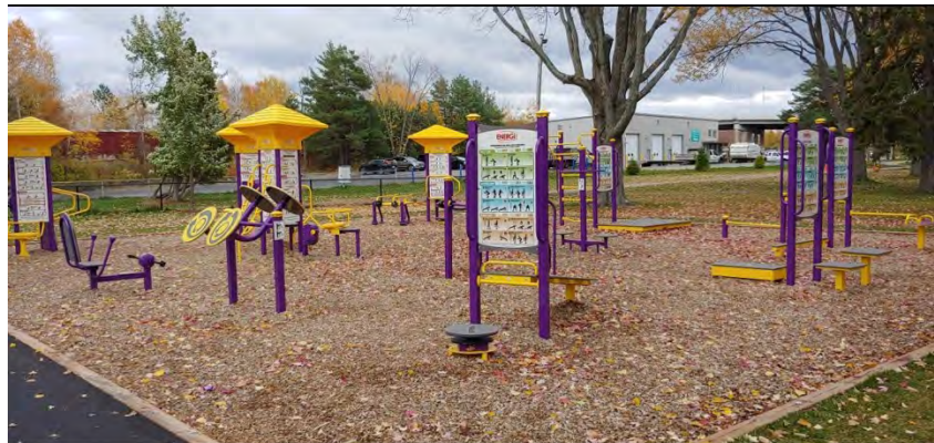
Multi-generational outdoor fitness equipment, adjacent to Kiwanis Playworld