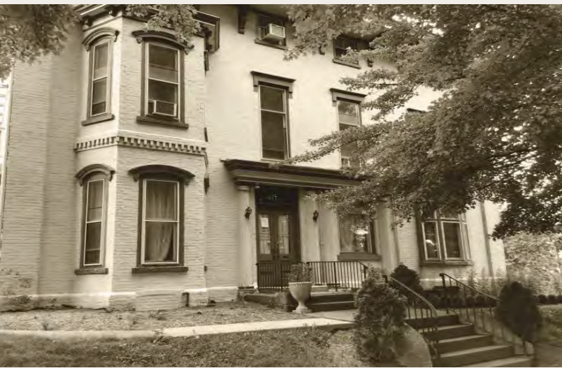
The former Kiwanis Children's Home still sits at 4th and Walnut, shown in this current photo.

By their quick thinking and willingness to put service to the community first, Kiwanis Club of Allentown members saved the lives of many and rescued innocent local children who might otherwise have died.