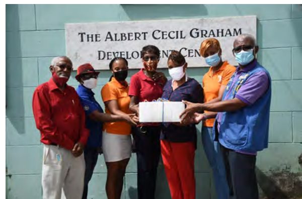
The North Club teamed up with the South and Bridgetown Clubs to donate face masks to the Albert Cecil Graham Development Centre, which caters to approximately 16 children with disabilities.

The club provided 18 food hampers to families in need. Some of these hampers were given to beneficiaries of the club's Sunday Feeding Programme, which was halted due to the COVID-19 curfew. A contribution of foodstuff and toilet tissues was also presented to the HIV Foodbank.