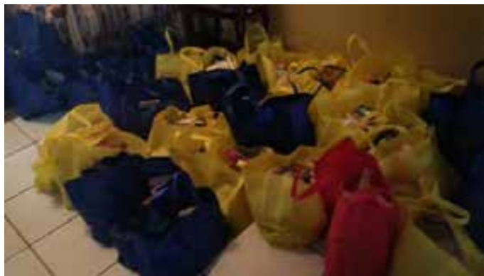
Kiwanis Club of New Kingston prepares Care Packages for University of Technology Student Nurses and Midwives.