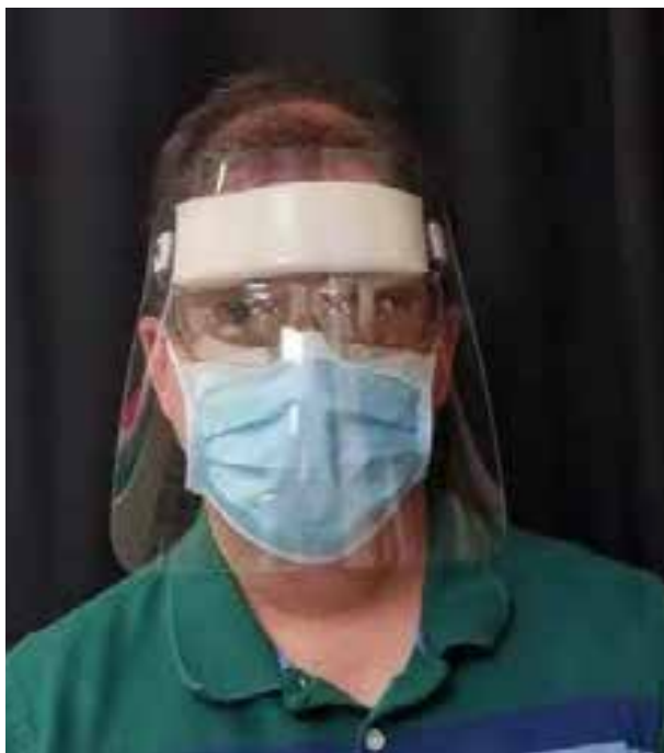
A medical face shield manufactured by Kenesky in London.

Local volunteers will be making 3,000 more face shields for healthcare workers across Sarnia-Lambton. The feat is being made possible through a $5,000 donation from the Seaway Kiwanis Club.