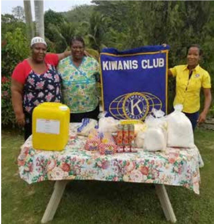
Kiwanis Club of Montego Bay donates food items and bleach to Garland Hall Children's Home in St. James.