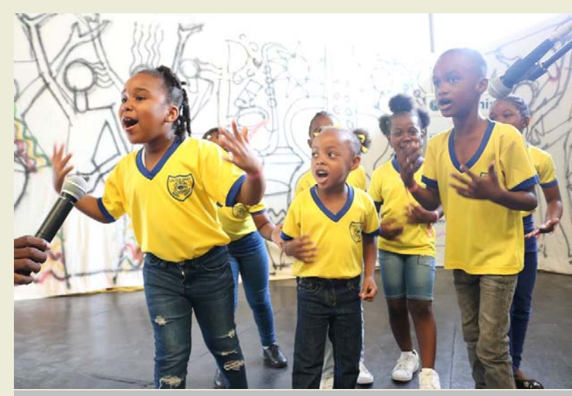
K-Kids from Lallyce Grey Basic School performing a Poem.

At the end of the Rally the winning Builders and K-Kids clubs in each of the 4 categories were: Dancing: