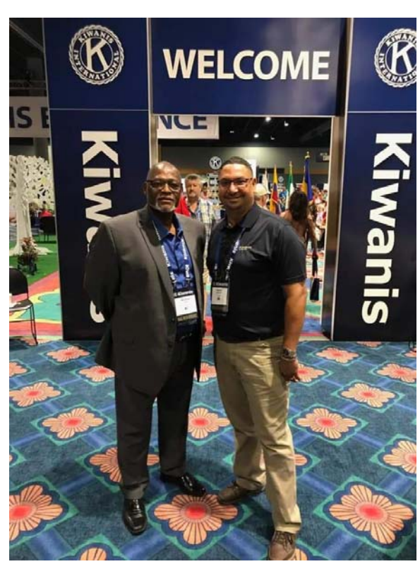
Governor Mel hangs out with a fellow Kiwanian at Kiwanis International Convention at Walt Disney.