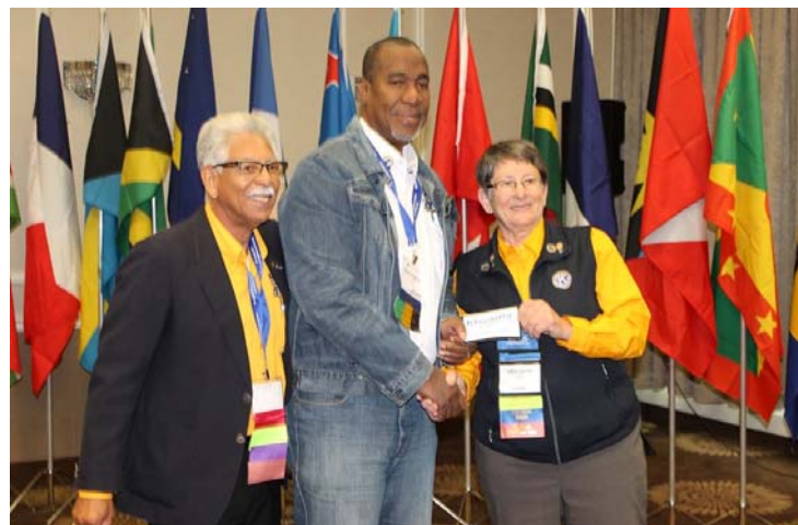
The Interclub Award went to Kiwanis Club of North St. Andrew.