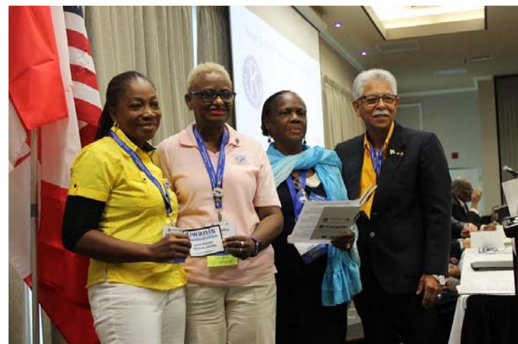
Kiwanis Club of Eastern St. Andrew copied the Ralph Taylor Memorial Gong for best Club Newsletter.