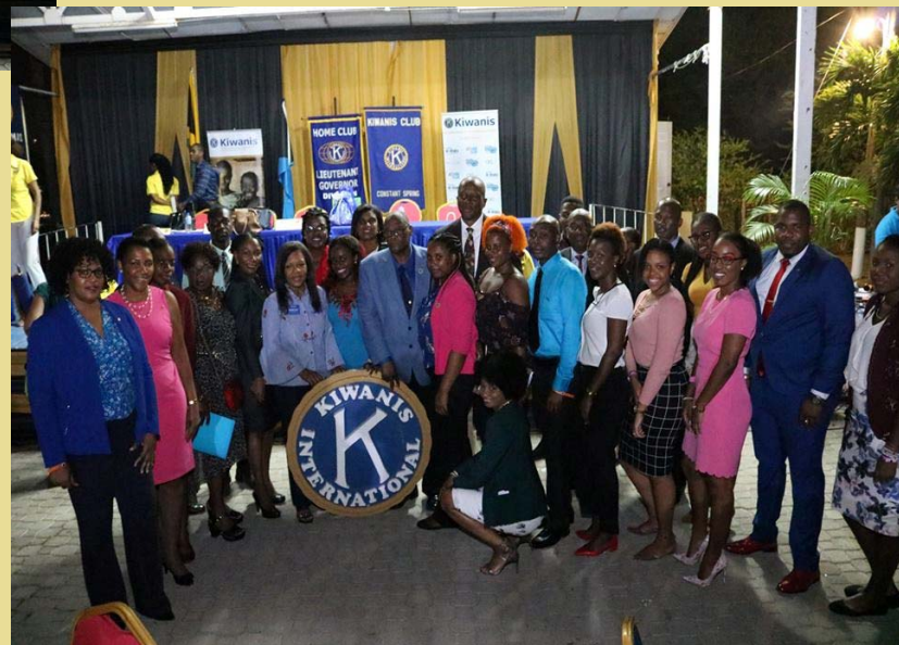
Division 23 East Inductees.