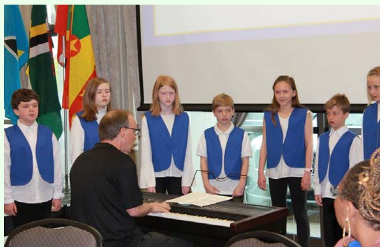
Avon Public School Choir provided entertainment at the Service Leadership Breakfast.