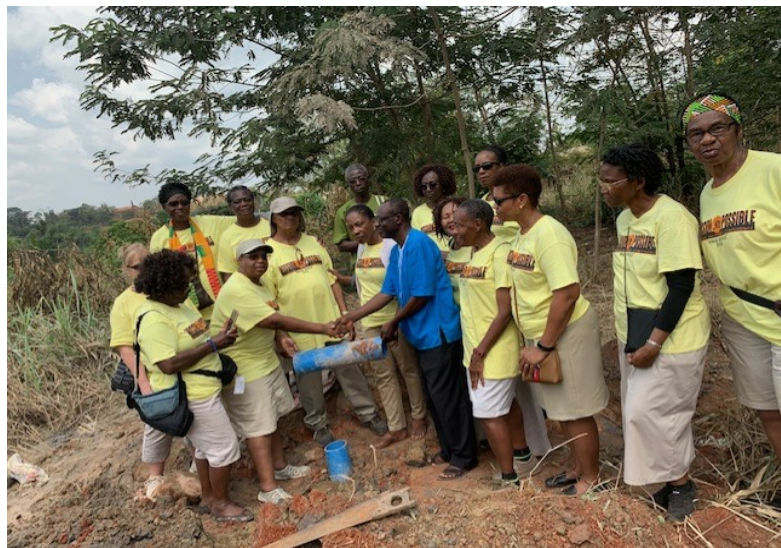
Symbolic handing over by Champlain Bev at the site for the

Having arrived on January 11, 2019, the team started its first