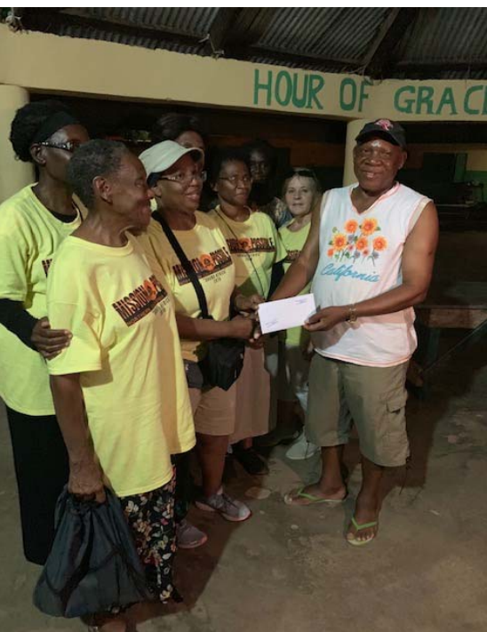
Presentation to the Hour of Grace Children's Home

The Thursday we went to the Seventh Day Adventist School which caters to approximately four thousand students. There, plans commenced for the implementation of the construction of a well to supply a portion of the campus, where the female students were exposed to being held up or raped having to walk a long distance to fetch water.