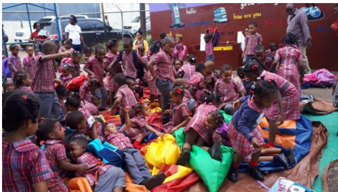
The children enjoying themselves on the bounce-a-about.