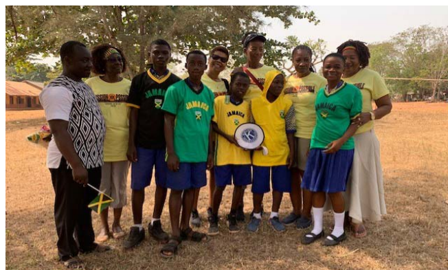
These children could not resist wearing their Jamaican T-Shirts.

We were able to serve mankind in a formidable way on our trip to the "Motherland"... changing the lives of children and adults by doing what we were born to do and fulfilling our purpose. By giving to others, whether it be ensuring that persons have water or by just a smile, we are sharing with others and helping to shape a better world for our children.