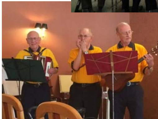
The Kiwanis Trio

On November 30, they will perform the same program at McCarthy Place in Stratford.