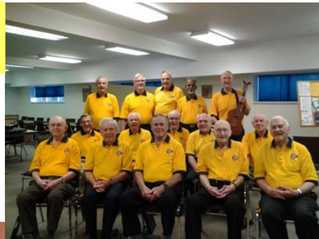
The Golden Oldies