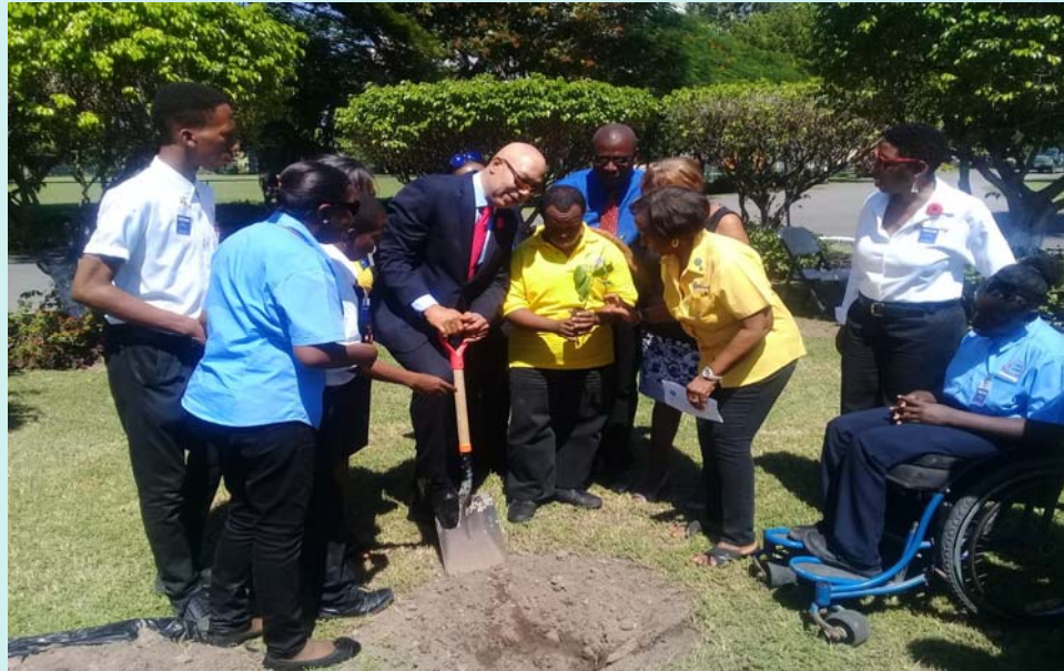
Governor General of Jamaica, Sir Patrick Allen, with Kiwanians, Special Olympics Jamaica, and persons living with disabilities plant the symbolic trees at Kings House to start off the Kiwanis One Day project

The day ended with a dance contest among Kiwanians and PLD members with the latter emerging the winners.