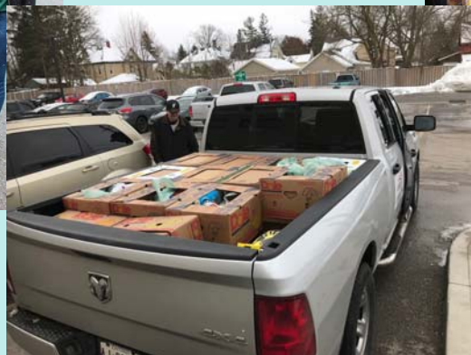
One of the trucks brought in by the Breslau Air Cadets.