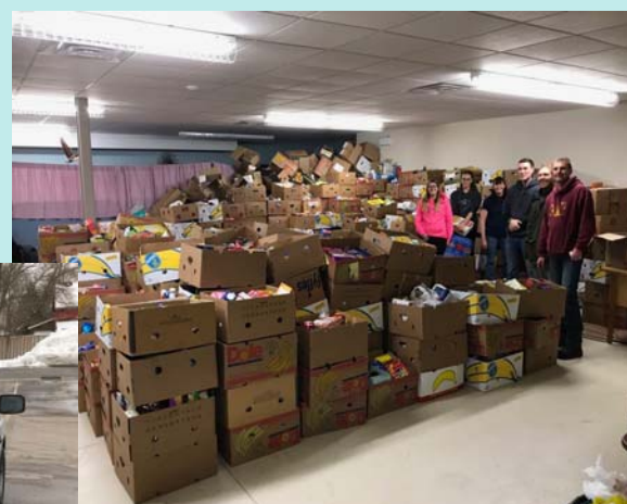
Some of the volunteers with over 600 cubic feet of banana boxes filled with food collected from the food drive.