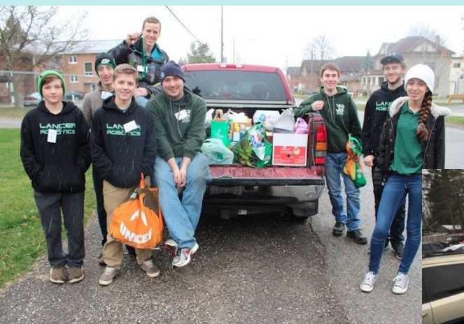
EDSS FIRST Robotics Club members take a short break for a photo op.