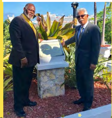
Governor Bobby and Governor Elect Melford Clarke at Government House on Mount Fitzwilliam, posed next to the plaque which reflects the history of Government House.