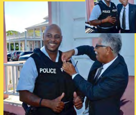
Governor Bobby pinning Constable Kemp 549 of the Royal Bahamas Police Force with an official kiwanis EC&C District Pin making him an honorary member. Governor Bobby was so impressed with the Royal treatment received as the were escorted around the island.