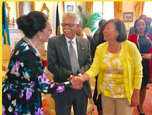
First Lady Josephine greets Her Excellency Dame Marguerite Pindling, Governor General of The Commonwealth of The Bahamas during a courtesy call at the Government House while Governor Bobby looks on.