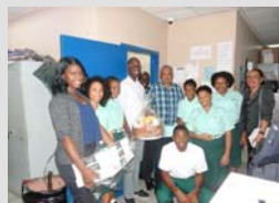
KeyClub St Augustine Secondary School