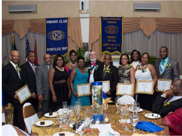
2016-2017 Board of Directors of Montego Bay Club.