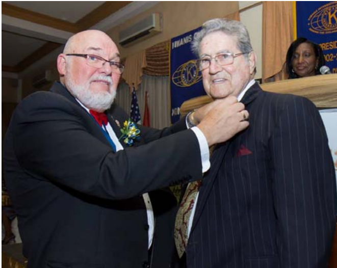
Governor Allen Ure pins Legion of Honour awardee Pino Maffesanti.