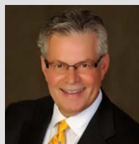
Governor Phil Rossy