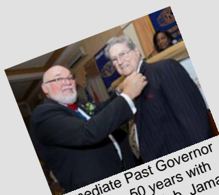
Immediate Past Governor celebrates 50 years with Montego Bay Club, Jamaica