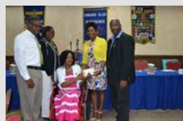
Launch of prosthetic limb for IPLG Inlen