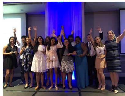
The Clint Whitfield Outstanding Awards is a yearly award handed over by the Kiwanis Club to exemplary students at Colegio Arubano. These students are not only chosen for their academic results but also for their personal qualities and achievements.