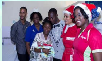
Christmas Baby Love