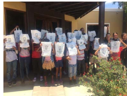
Smile Makers Project: Dental cleaning and check ups for over more than 20 children