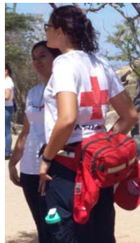
Kiwanis Club of Aruba donates Awg 10,000 to the Red Cross Aruba to help cover expenses caused by the unexpected severe weather on Aruba

This year the Key Club of Colegio Arubano celebrated their 40 th anniversary. The Kiwanis Club of Aruba together with the key clubbers organized a reunion party of all of the Key Club alumni members and current Key Club members. During the event, there was also a 'down the memory lane' hall with 40 years worth of pictures and Key Club memories.