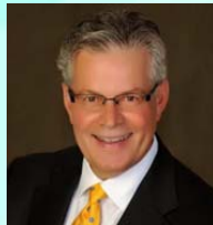
Governor Phil Rossy