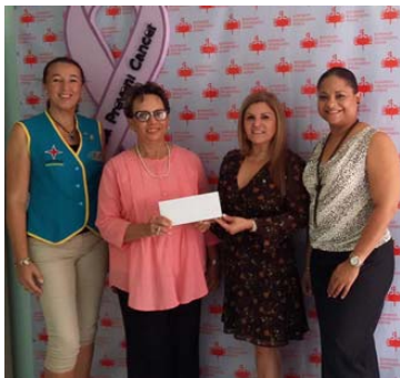
Kiwanis Club of Aruba donates Awg 2000,- to Wilhelmina Kankerfonds Foundation

A few of our club members went around the neighborhoods of Aruba to pay a visit to the children by giving goodie bags and gifts along with our Zwarte Pietjes