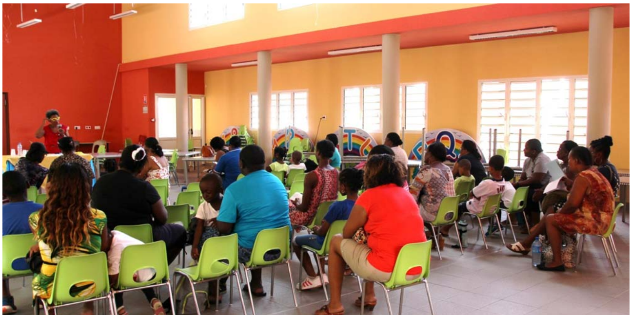
Information session on young children's sight problems

During one of many meetings of parents de l'Ecole Maternelle de Trois-Rivières, en Guadeloupe.