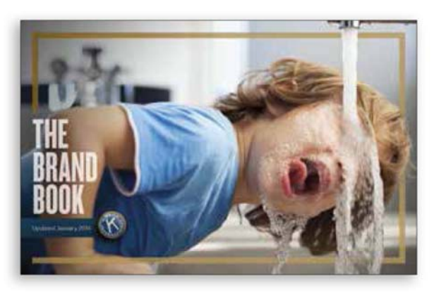
Download the Kiwanis Brand Book at Kiwanis.org/brand.