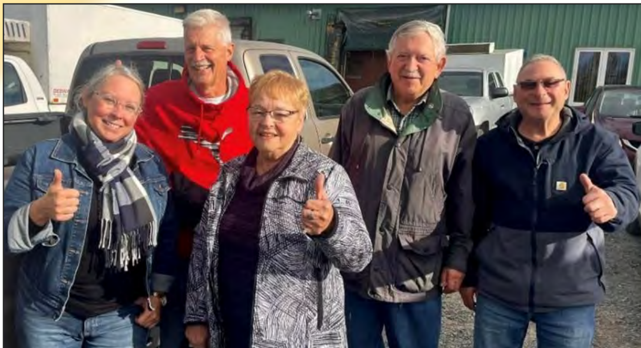
Club Members with Partner Budovitch where we store our cheese.

over $10,000 worth of cheese, well deserving of the Big Cheese Award for the 3rd year in a row! We were assisted by the Golden Club which partners with us to sell and buy cheese. Over $6,500 was raised to assist the Fredericton Kiwanis Youth Choir.