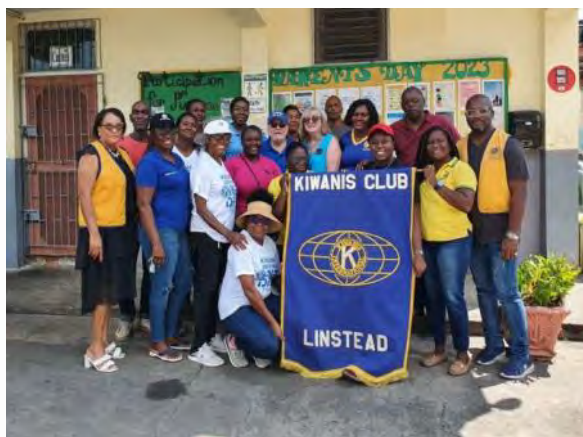
Members of the Kiwanis Club of Linstead posed for a group photo after completing their project to paint a Pedestrian Crossing in Ewarton, Linstead.