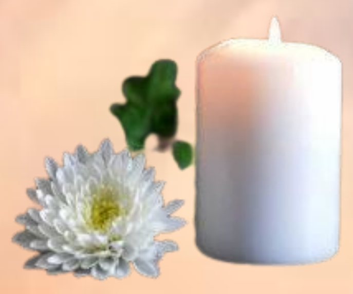
Share the Memories

SUNSET: Friday, March 31, 2023, at the age of 99