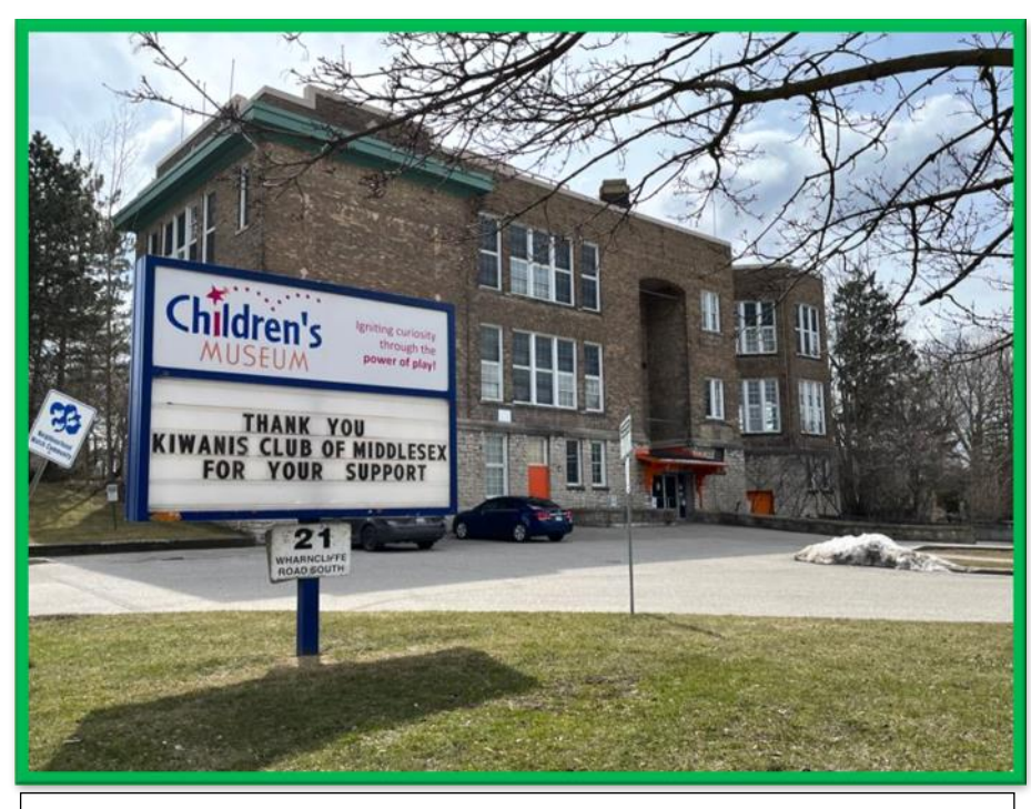
Sign in front of the current London Children's Museum thanking Middlesex Kiwanis for our support.

In the past 49 years, Middlesex members have raised money and participated in service projects in London as well as those projects initiated by Kiwanis International (such as the Neo-Natal Tetanus Project) and our District Aids Project. Middlesex will celebrate the 50th anniversary of receiving its charter in 2024.