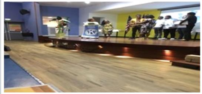
The winner, « Student » category