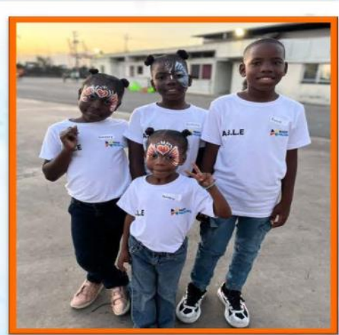
Newsletter - Eastern Canada and the Caribbean District