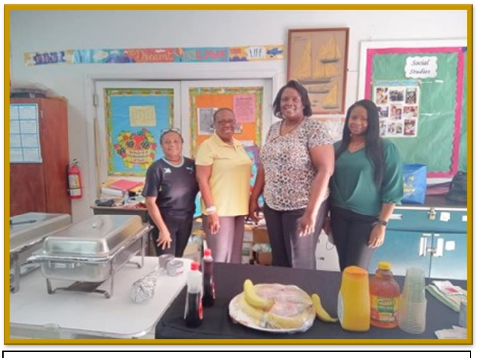
Kiwanians preparing to serve breakfast at the Exuma School for Exceptional Learners

water to various schools on the island of Great Exuma. The meal usually consists of pancakes, french toast, bacon, eggs, sausage, or sometimes grits with tuna salad or streamed sausages. Since its inception, the program has included the service