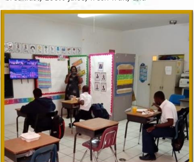
Students enjoying the delicious breakfast served!

This program features delivering a hot breakfast, 100% juice, fresh fruit, and