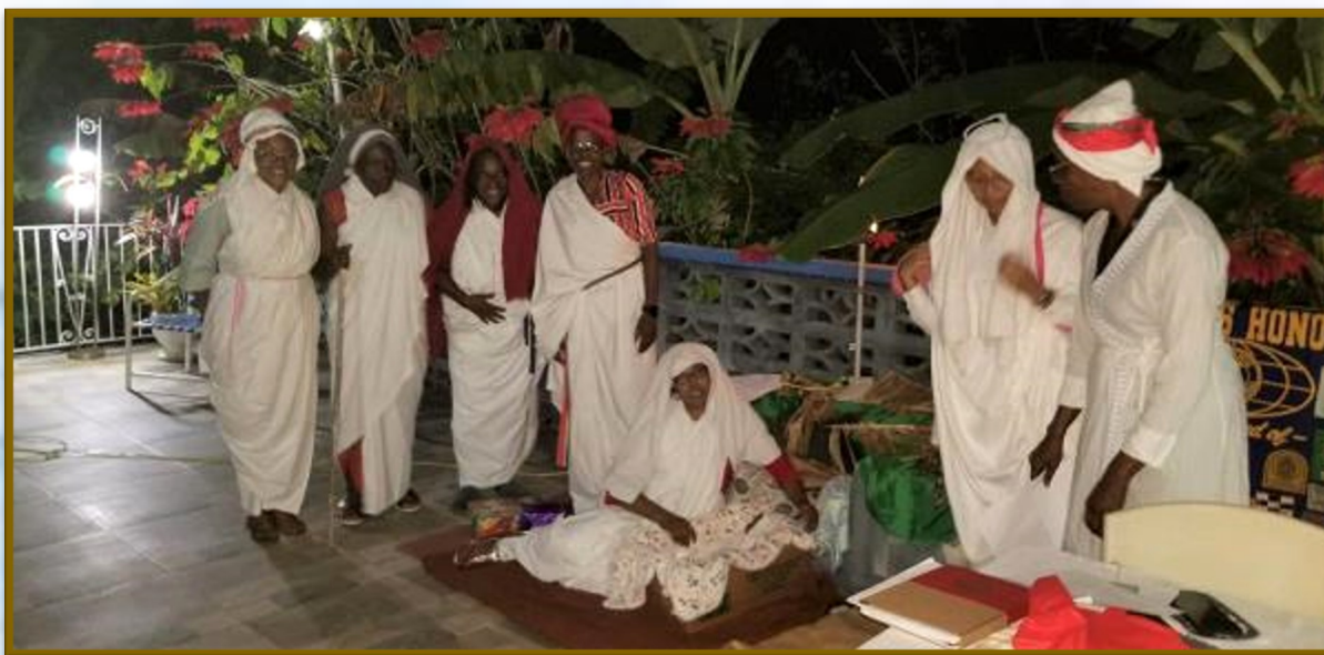
Members of the Kiwanis Club of Providence-Montego Bay in action at their Christmas meeting production of the Holy Nativity

The Kiwanis Club of Providence, Montego Bay, in the continuity of love, togetherness, and sharing, wishes all Kiwanians around the globe a safe, productive, and Happy New Year!!!!!!