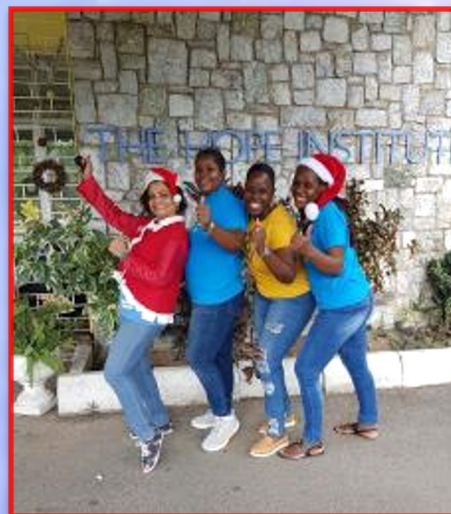
KCWK members celebrating after the New Year's Project