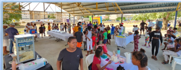
A HOLIDAY ATMOSPHERE! It's a buzz of activities under the recently constructed gazebo at the KCDK Children's Park.