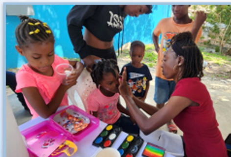
IT IS FACE PAINTING TIME!

The children were treated with refreshments and gifts and enjoyed a wide range of entertaining activities which included face painting and watching movies.