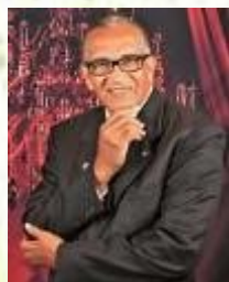
Anthony Haile Governor KC of Curaçao