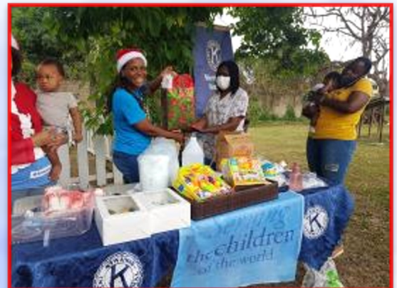
KCWK members serving treats to Teen Mothers and Babies