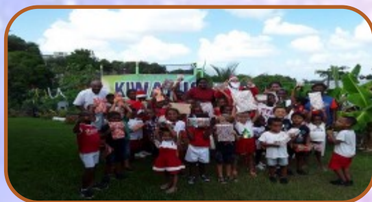
All together with Santa Claus who handed out the gifts.