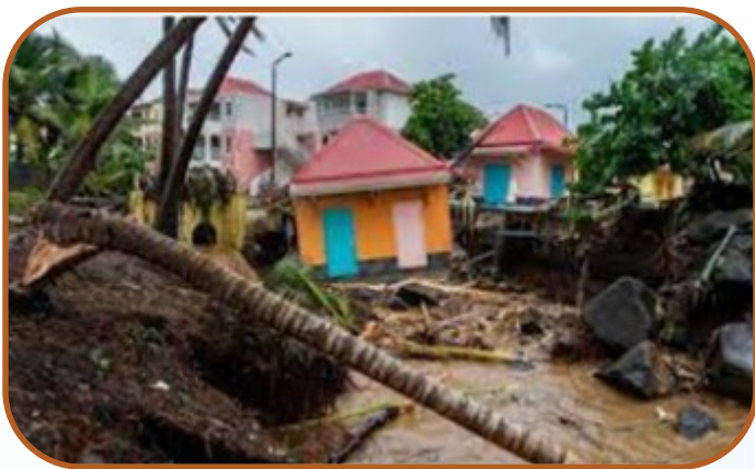
October : Delivery of water bottles to la Basse Terre by René Claire despite closed roads