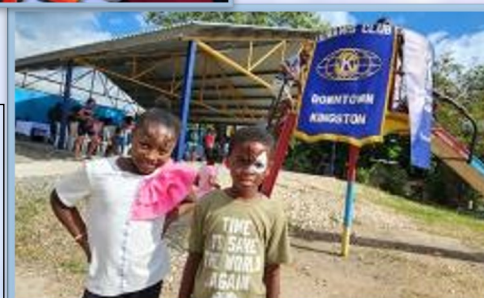
I GOT MY HOLIDAY FACE ON! Youngsters take time-out to pose after having their faces painted.