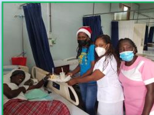
KCWK serves treats to a Patient.