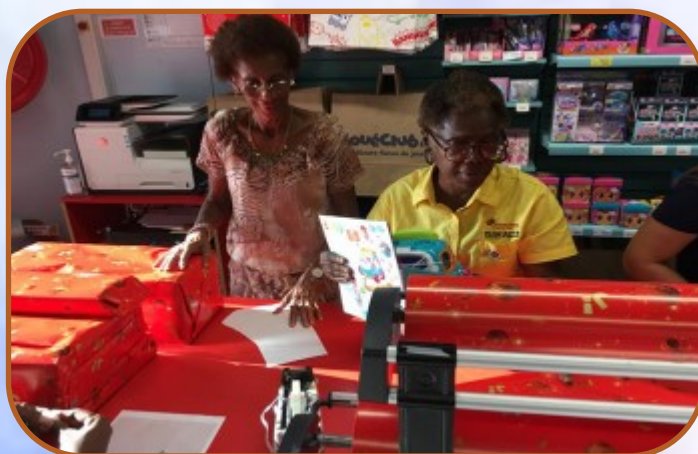
December : Wrapping of the gifts for the children at JOUET CLUB.