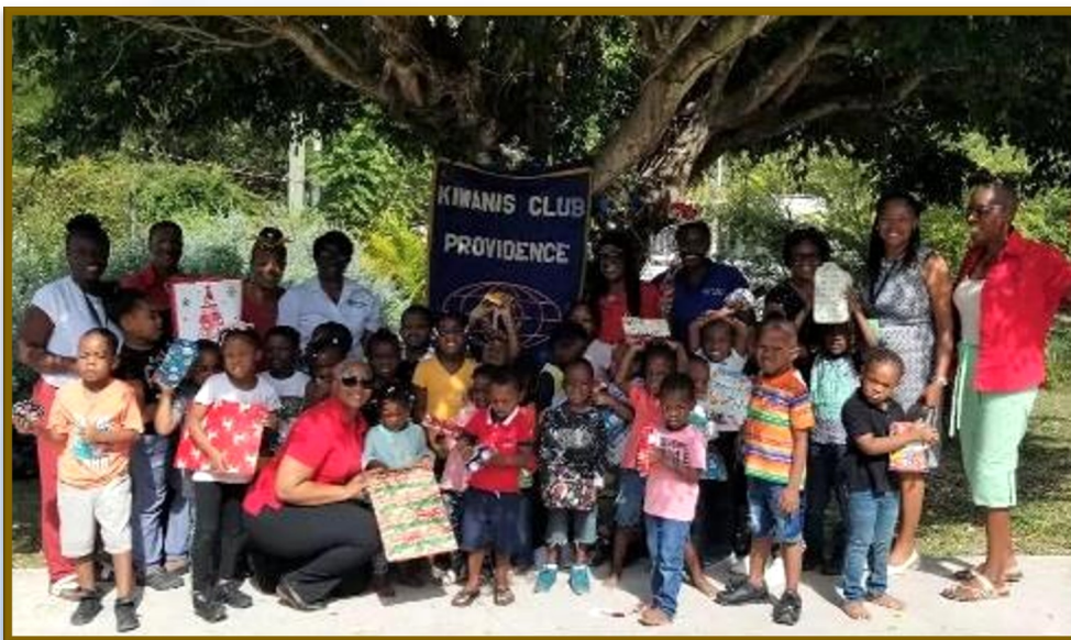
Members of the Kiwanis Club of Providence - Montego Bay and Students of James Rodlyn Basic school posing for the camera with their gifts.

Several Service Leadership Program (SLP) clubs benefitted from the club's joint involvement in presenting gifts to the indigent of their respective communities.