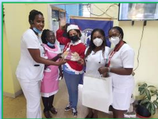
KCWK members with nurses at the Cancer Hospital