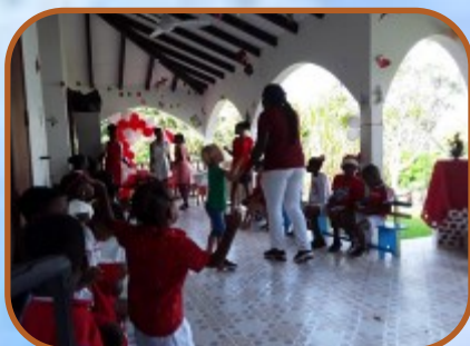
The Principal in action with the children of the nursery.