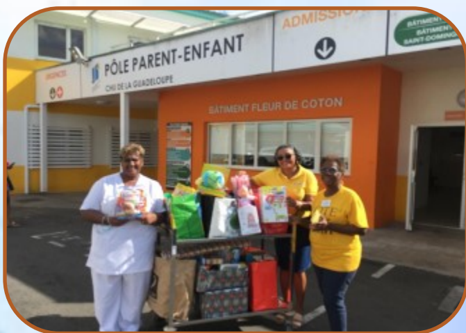
December : Presentation of gifts to the CHU children. Our club participated to the financing of those gifts for our Division 27C.