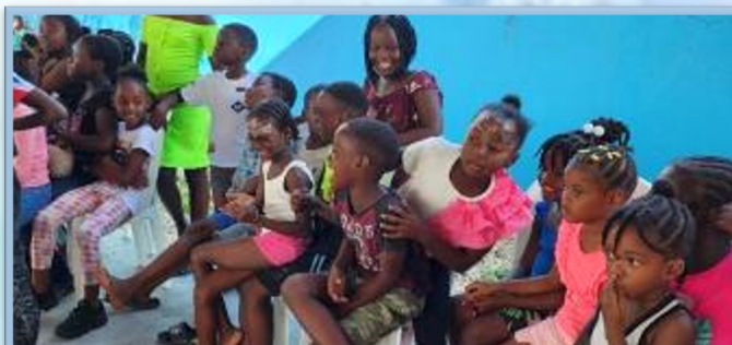
WATCH THOSE MOVES! Children looking on as they enjoy the dancing competition.