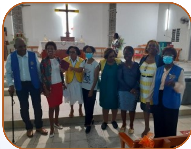
November: Mass for our deceased fellow Kiwanians at l'Église Saint Michel du Raizet aux Abymes. Thanks to all our friends and supporters.