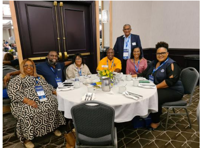
Governor Anthony & the delegation of Curaçao