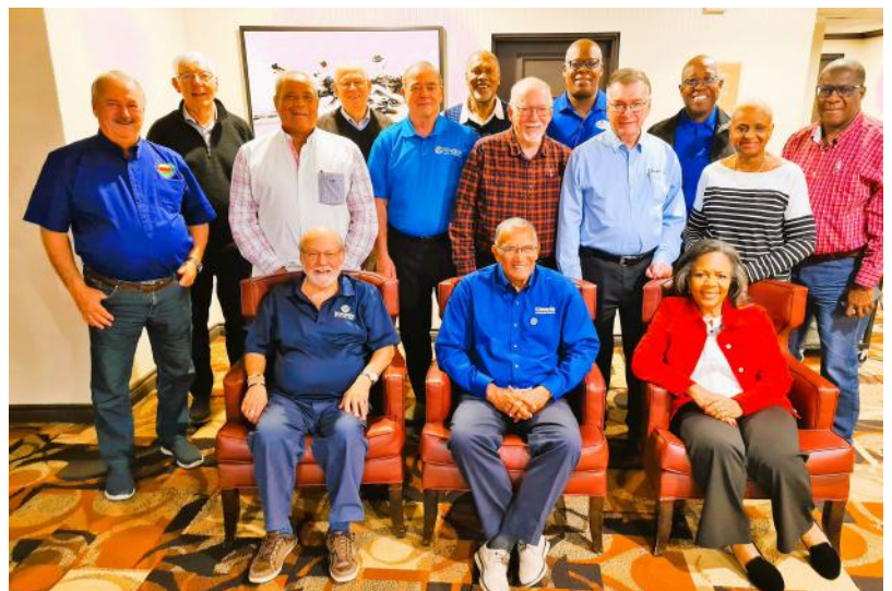
Goup picture of face-to-face meeting in Toronto with District Leaders