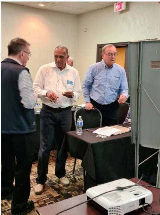
Goup picture of face-to-face discussions in Toronto with District Leaders