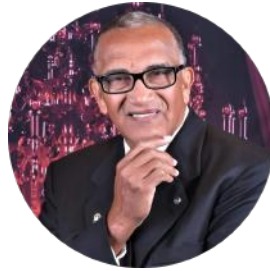
Anthony Haile Governor KC of Curaçao