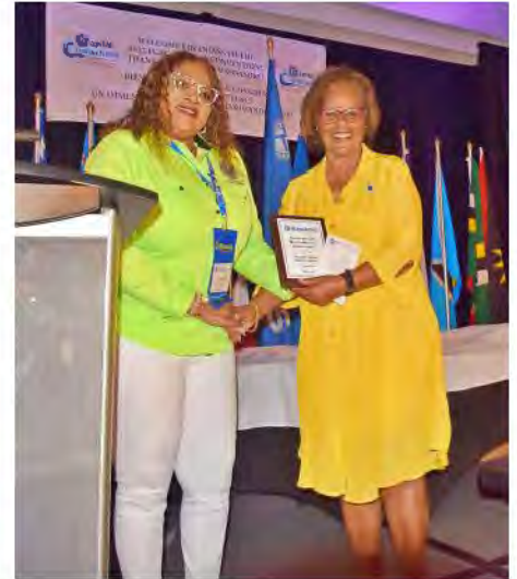
Runner-up Bulletin Award - Laurent Girouard Award - Kiwanis Club of South St. Andrew