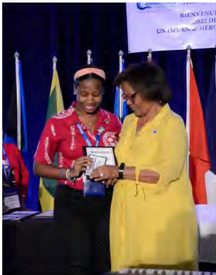
Bulletin Award - Ralph S. Taylor Memorial Gong - Kiwanis Club of New Providence