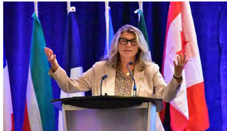
Mayor of Fredericton, Kate Rogers