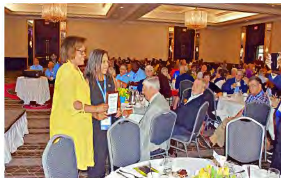
Fred G. McAllister Service Award is presented to an individual who has performed the most outstanding service to their local community through Kiwanis during the Kiwanis year.