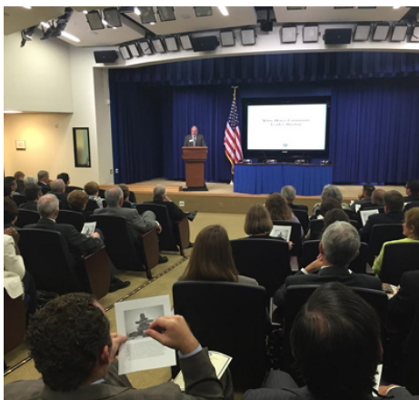
White House, Kiwanis members to discuss ways to improve communities April 29, 2015