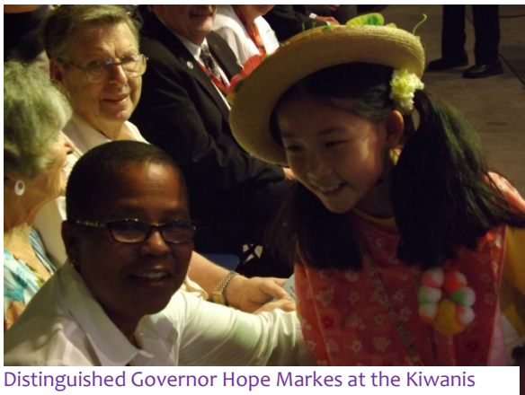
Distinguished Governor Hope Markes at the Kiwanis International Convention