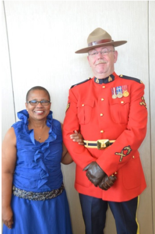
A touch of Canadiana!

It is the Governor who is the convention leader. In addition to your other duties, you will chair board meetings and delegate sessions, and be available for all delegates. You will need to plan to escort the visiting International Trustee and spouse at the District Convention.